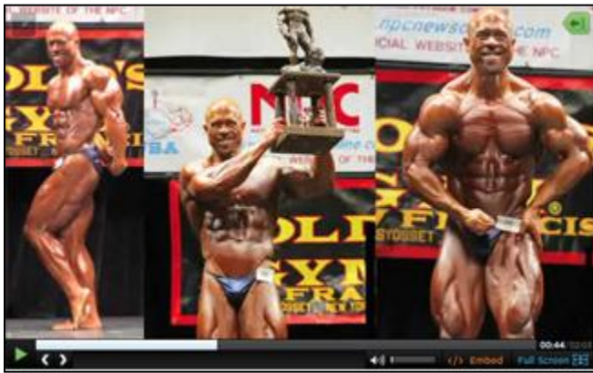
VIDEO - About Skip La Cour

Here is a reference guide and links to some of the best questions answered in my thread on the Bodybuilding.com Forum . Now, you won't miss any of the extremely helpful information that's contained within all of its 113 pages .